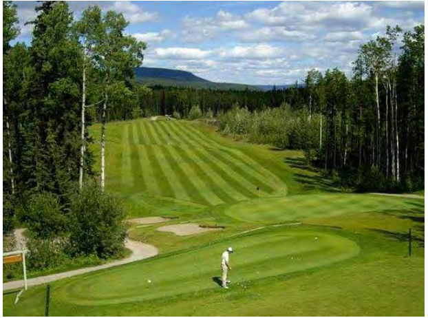
Tumbler Ridge Golf Course

The TR Trail follows some of the Wolverine Trail, built as cross country ski trails, before descending to the Murray River via Larry's Trail. There are spurs to two riverside sites with views of the Bergeron Cliffs, then it climbs up to the WNMS Lost Haven Cabin up Linda's Trail (the roughest and most challenging section of the TR Trail).