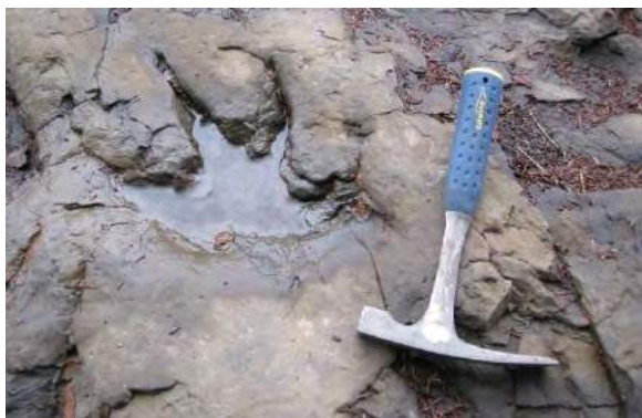
Theropod Footprint at Cabin Pool

horizontal rock layers. The main overhanging rock is formed from the same thick sandstone bed that crossed the creek at Top Pool, and that are seen again at Flatbed Falls and the Mini Falls. Water depth varies from year to year. Some years it is safe to jump into the creek from one of the rocks upstream from the Overhanging Rock. Always check depth before jumping, and do not dive in.