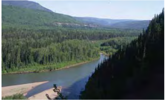
Final Viewpoint of the Murray River

The final viewpoint (km 24.6) at the end of a spur off Escher's Loop offers a bench that overlooks the valley as the Murray River courses northwards. It is two days by canoe to the next bridge, through pristine wilderness, a magnificent canyon, and