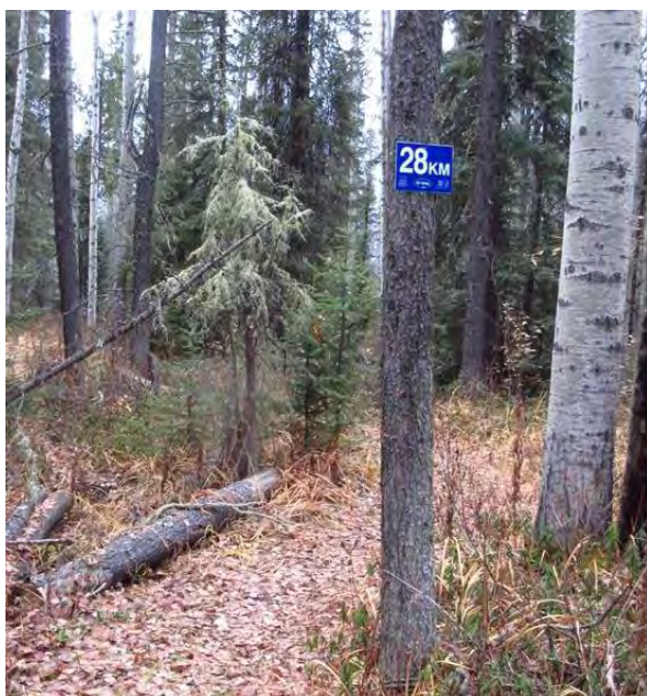
Final Kilometre Marker

Finally, the last kilometre marker is seen (km 28.0), and the end of the trail is reached behind the ball diamonds.