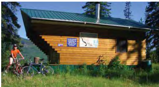
Lost Haven Cabin

Lost Haven Cabin (km 23.3) is an excellent cross country ski destination in winter, and is a hub for hikers, mountain bikers and horseback riders in