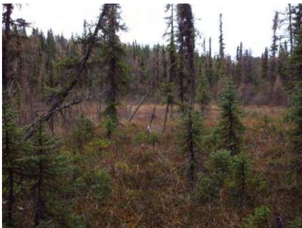
Black Spruce Bog

Beside the trail here you will see Labrador tea, sphagnum moss, horse-tails and lingonberry. These are all important plants to First Nations people in the region, and have been for thousands of years.