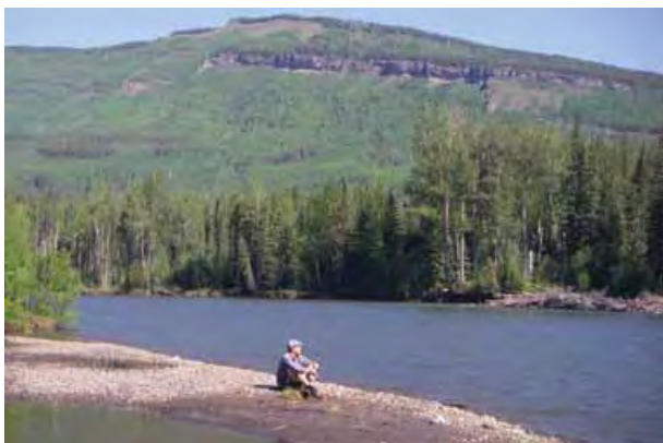
The Murray River

The second spur trail leads left to the Murray River (km 22.3). Here, as the river curves left, it encounters a transition. For the past few kilometres it has passed through Pleistocene deposits from the last Ice Age, characterized by soft sediments and slumping. It now