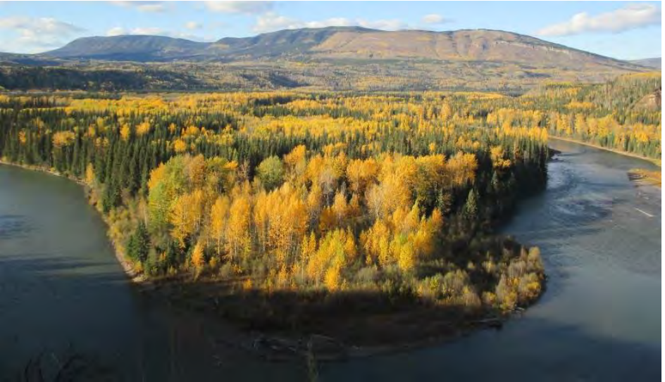
View from the Tumbler Point Trail

North-facing slopes are usually moist and thickly vegetated, but this is not the case at the Murray River viewpoint (km 15.9). The Murray River is actively washing away at the thick sands and gravels that form the river bank, and slides and small rockfalls are common. This explains why the trail avoids the edge here, as it is unstable, especially in spring at times of repeated freeze