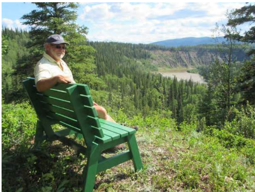
View from the Hault Bench on Nathan's Trail

Before reaching the golf course parking lot, the trail leads along the edge of a terrace, with outstanding views of the Murray River below and the foothills in the distance. There is a bench from which to enjoy the view. This section of the TR Trail is known as Nathan's Trail .